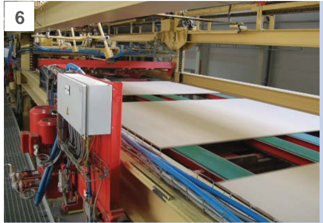
Finally, the board is sanded and cut to the sizes required by the clients.