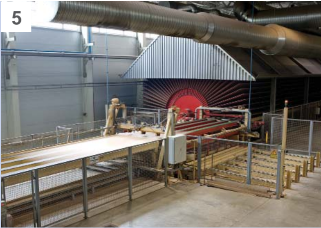
The pressed board is cooled down in a “star cooler”, a special device reminiscent of a large fan.