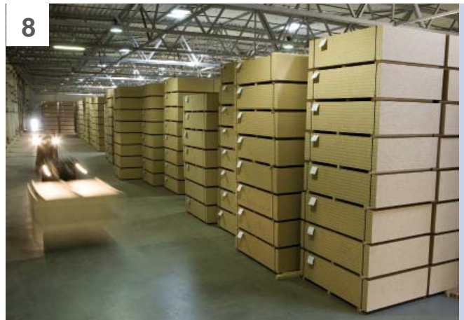
The warehouse at Swedspan Giriu Bizonas can store up to 40,000 cubic metres of boards. They are delivered to the clients as required.