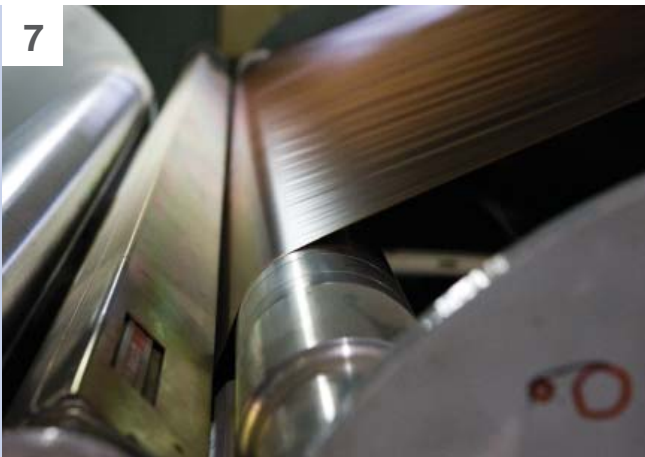
Some of the polished boards are faced with a special foil with a décor imitating different types of wood. The particle board is now ready to become part of a piece of furniture.